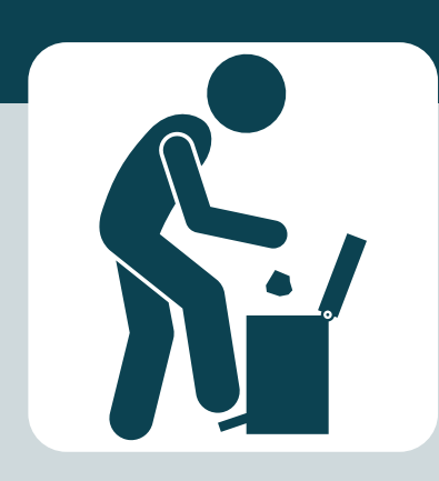
Use disposable tissues and throw them away immediately.