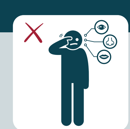
Avoid touching your eyes, nose and mouth, as the infection is spread by hands.