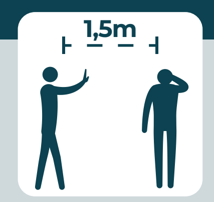
If you have any symptoms of respiratory illness, avoid close contact (keeping a safety distance of approximately one meter/three feet) with other people.